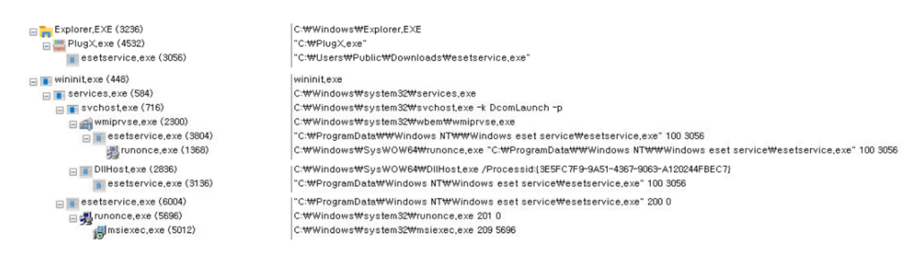
Figure 8. Process tree

The PlugX used in the attack offers various modes according to the argument given. The following is a process tree that can be found when the PlugX that is currently being analyzed is executed. It can be inferred that the 4 modes, "100", "200", "201", and "209" are executed in order.